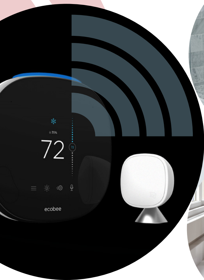
Ecobee Smart Thermostat