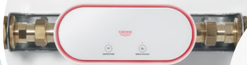
Grohe Sense & Sense Guard