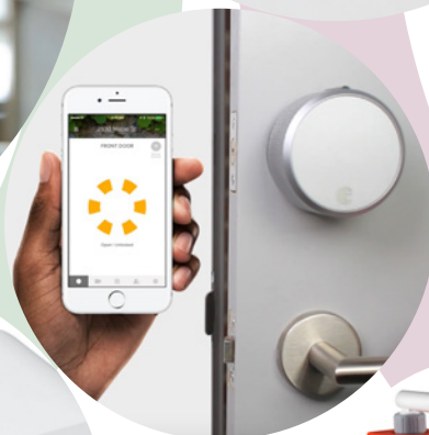
August Smart Connect Lock