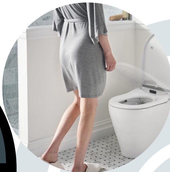
DXV SpaLet Smart Bidet Toilet