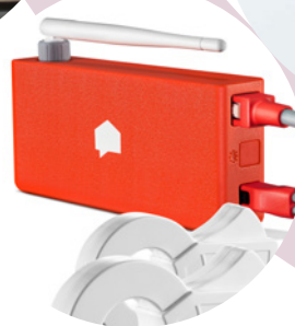
Sense Energy Monitor

spa experiences plus settings for steam, light, and music.