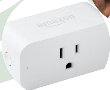
Amazon Smart Plug